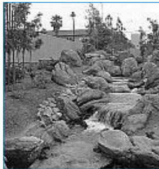
View of the Japanese Friendship Gardens in Phoenix. The Garden is the product and shared cultural vision of the Sister Cities of Phoenix and Himeji, Japan.