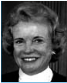
Supreme Court Justice Sandra Day O'Connor

After 24 years on the Supreme Court, Justice Sandra Day O'Connor announced her retirement. Appointed by President Ronald Reagan, O'Connor was the first woman to serve on the highest court in the nation. Admired by leaders from both sides of the aisle for her judicial pragmatism, O'Connor spent her career excelling in fields dominated by men.