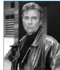
John Walsh, Host "America's Most Wanted"