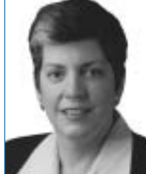
Janet Napolitano, Arizona Governor