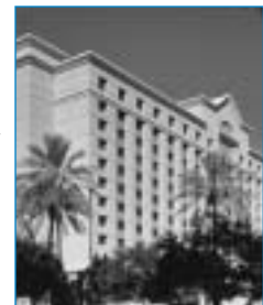
The Ritz-Carlton, Phoenix

See page 2 for a list of Committee members.