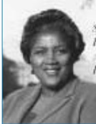
Donna Brazile, Democratic Strategist

Visit the NFWL website, www.womenlegislators.org , for the latest information on the conference agenda and speakers.