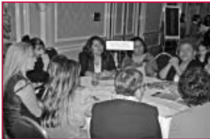
Participants at the Violence Against Native Women roundtable learn about this specific populations' particular challenges with domestic violence.

Roundtable sponsors included Snell & Wilmer who presented a panel of industry, government, and legal representatives to discuss how the issue of ensuring reliable and affordable electric service into the future is being confronted; the University of Phoenix who conducted a roundtable on higher education and the use of technology in pursuing advanced degrees; the Arizona Indian Gaming Association who added a new perspective on domestic violence by providing experts on violence against Native women; and the Friedman Foundation who brought the issue of school choice to the attention of legislators.