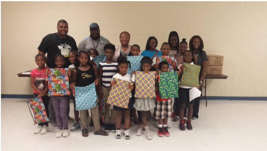
Senator Thompson with students from Parramore Kidz Zone.