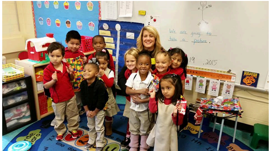
(Minnesota)- Senator Carrie Ruud at Crosslake Charter School on 10/21/15 distributing 150 backpacks.