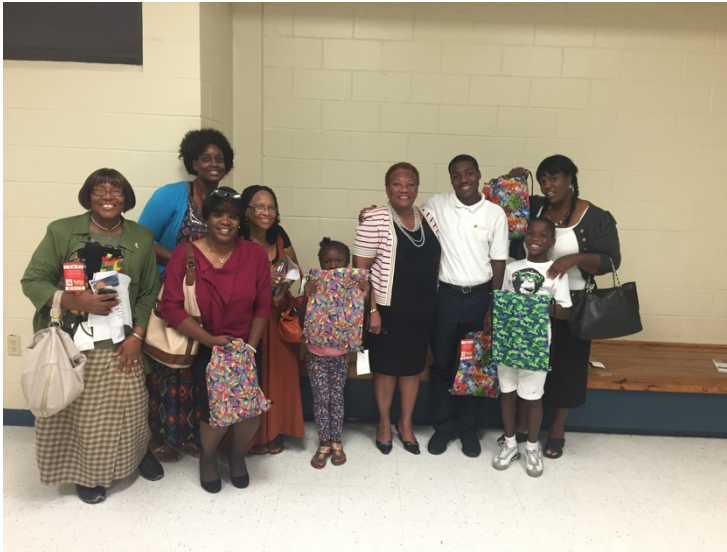
Senator Thompson with students from Youth Central, Inc.

(Florida)- Senator Geraldine Thompson dispersing 150 backpacks at three different educational facilities on 9/24/15.